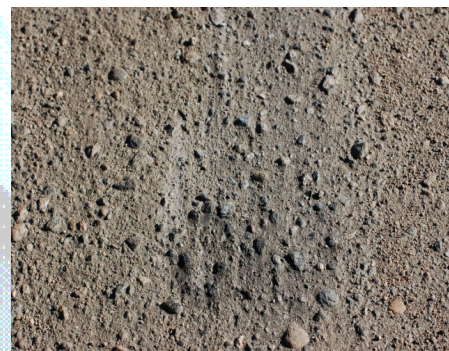
Flex Treated Road After 5 Months

For more information on Flex, call Envirotech Services, Inc at 1-800-369-3878